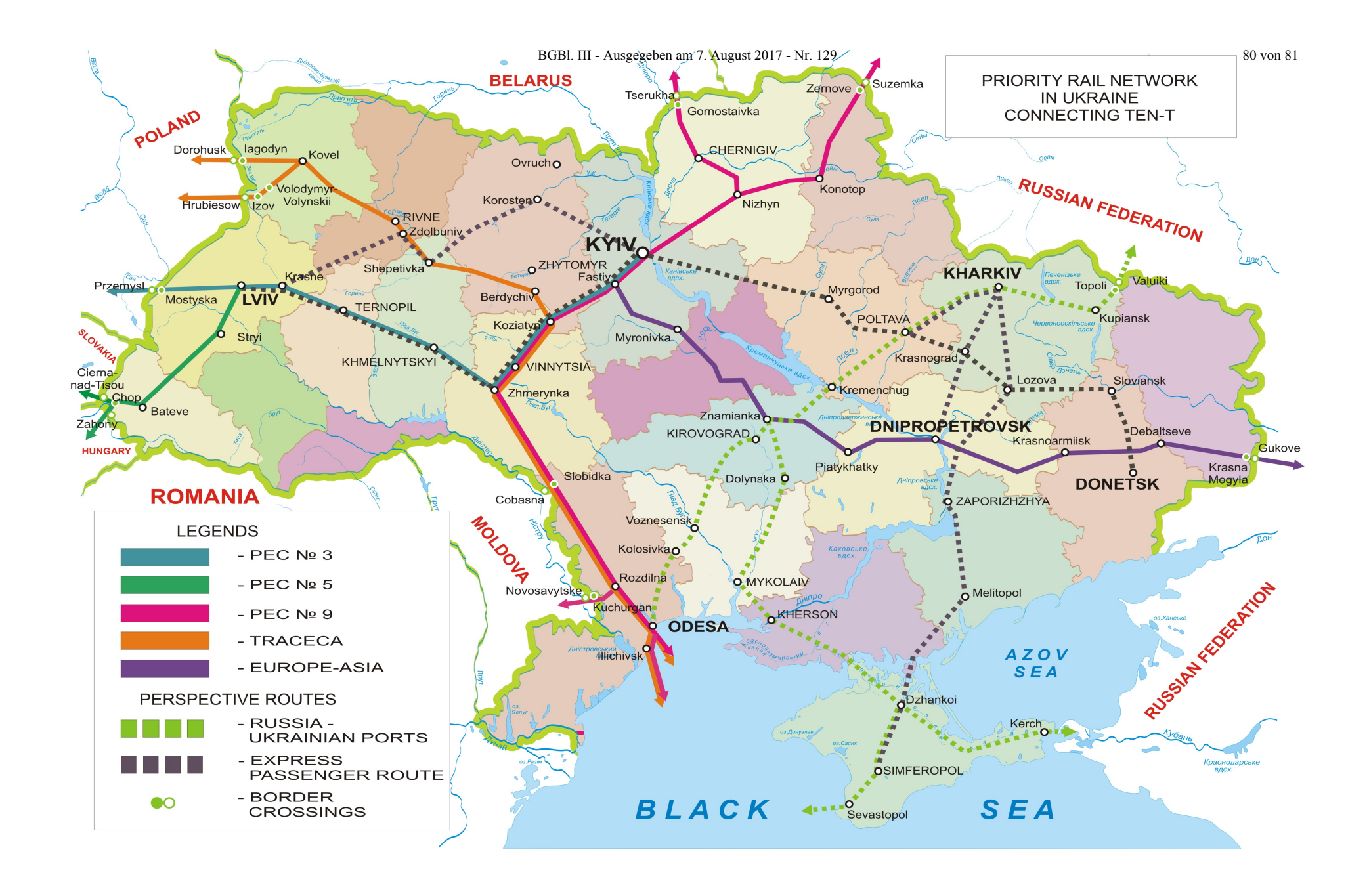
EU/UA/Annex XXXIII/en 3